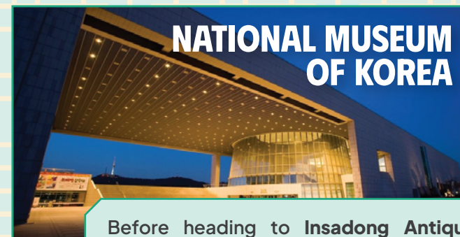
NATIONAL MUSEUM OF KOREA

After that, transfer you to the restaurant for a delicious local lunch.